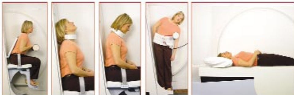
Positional Imaging: One Side of the Fonar Dynamic™ Upright® MRI Removed for Photography.

The protocol for radiation-free monitoring of scoliosis by the Fonar Dynamic™ Upright® MRI can be performed in the same amount of time and at the same cost as X-ray monitoring. It is imperative that every hospital and practice performing scoliosis examinations consider providing their patients with the radiation-free choice that is finally available because of the unique benefits of the Fonar Dynamic™ Upright® MRI.